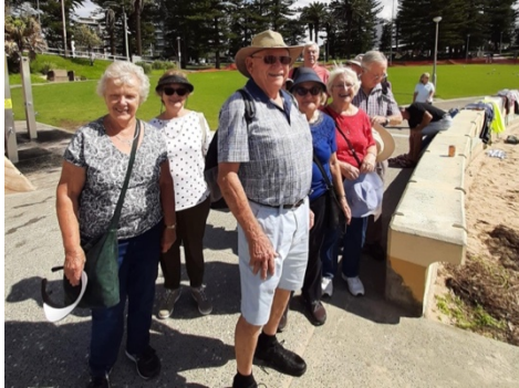
Short Walk Cronulla Beach